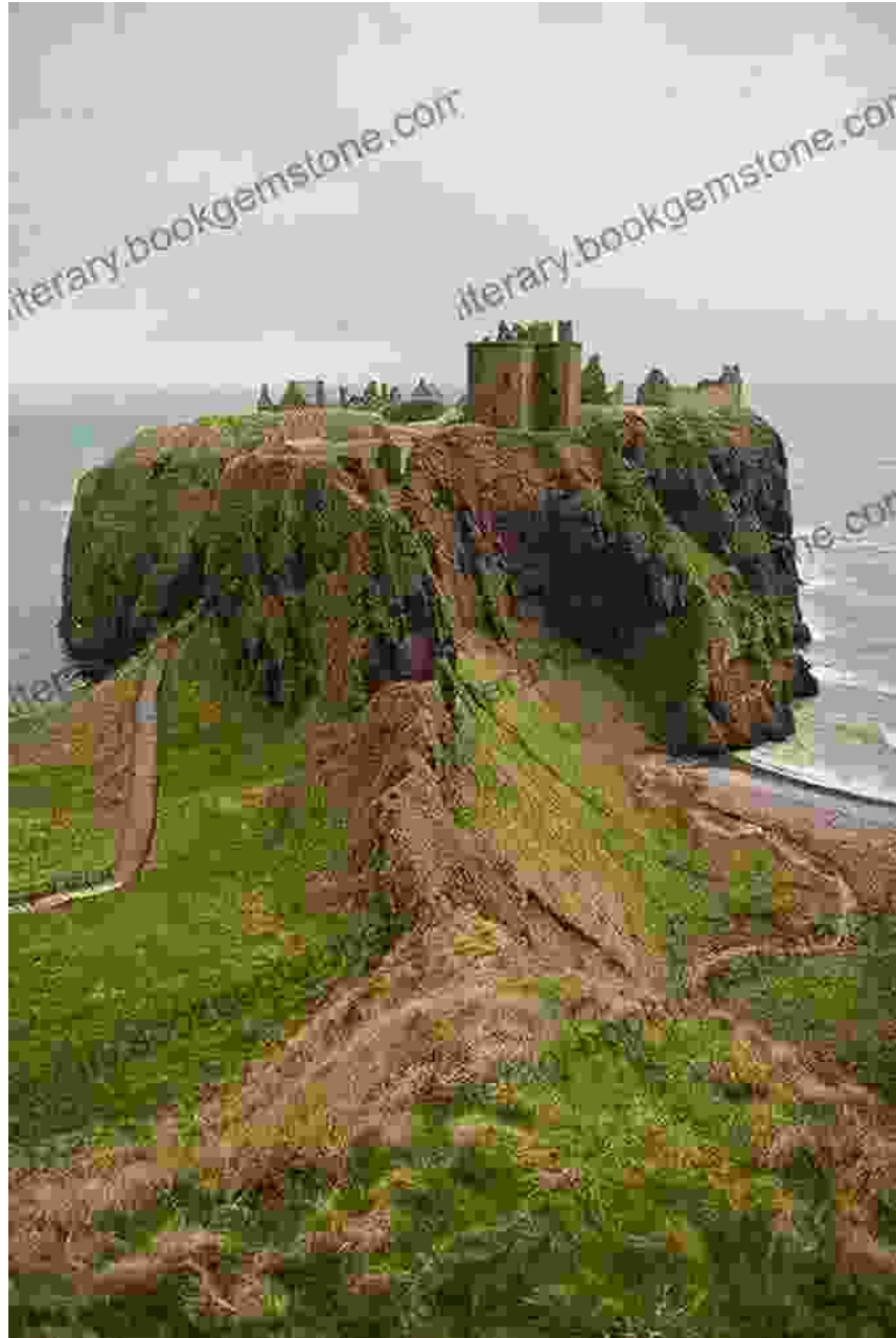
A grand Scottish castle offers a majestic setting for a Highland wedding.