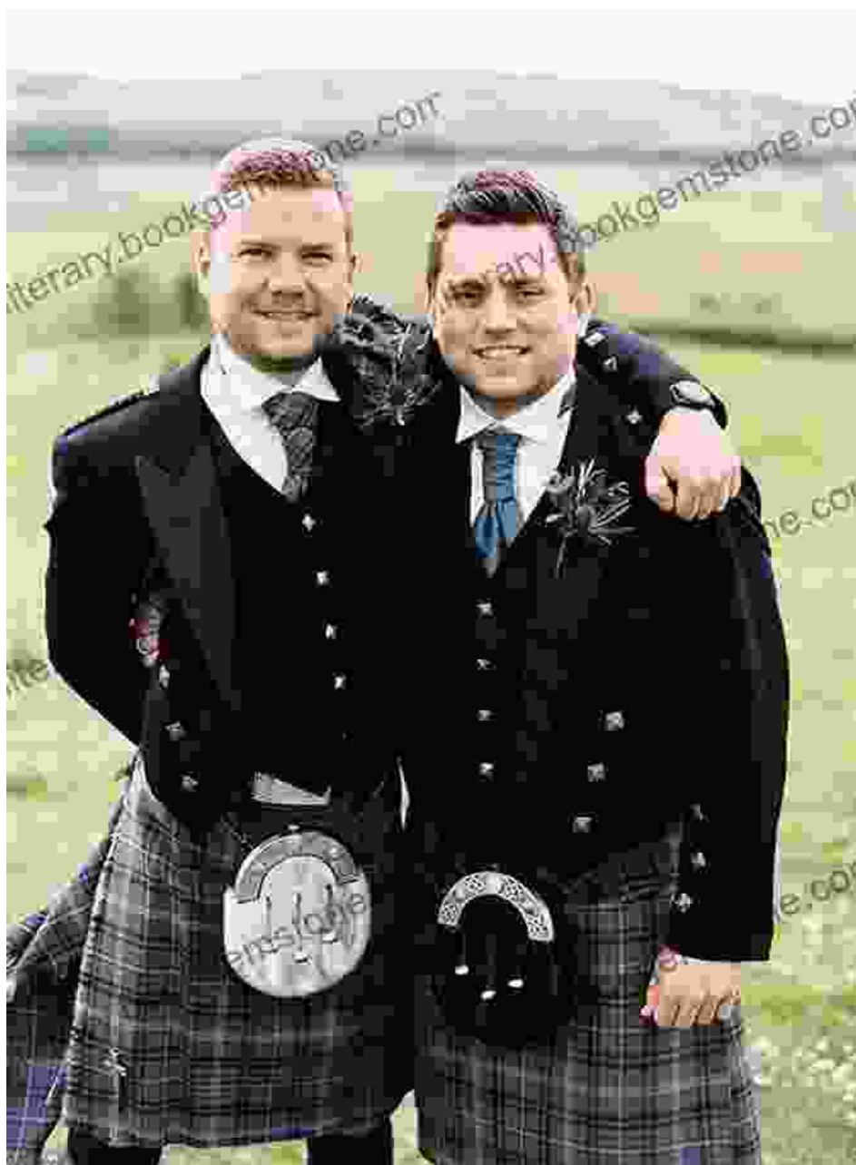
The groom in a traditional Scottish kilt.

kilt, a symbol of Scottish identity, while the bride can opt for a tartan gown, a vibrant and elegant garment that reflects her Scottish roots.