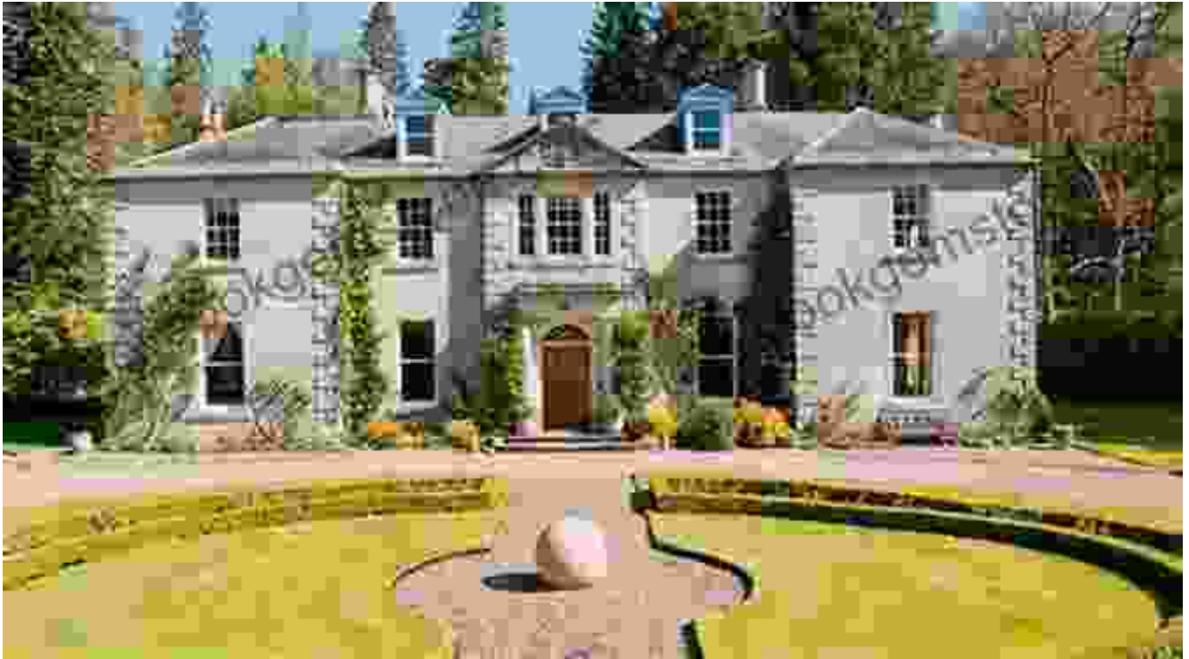
A charming Scottish country estate provides a cozy and intimate setting.