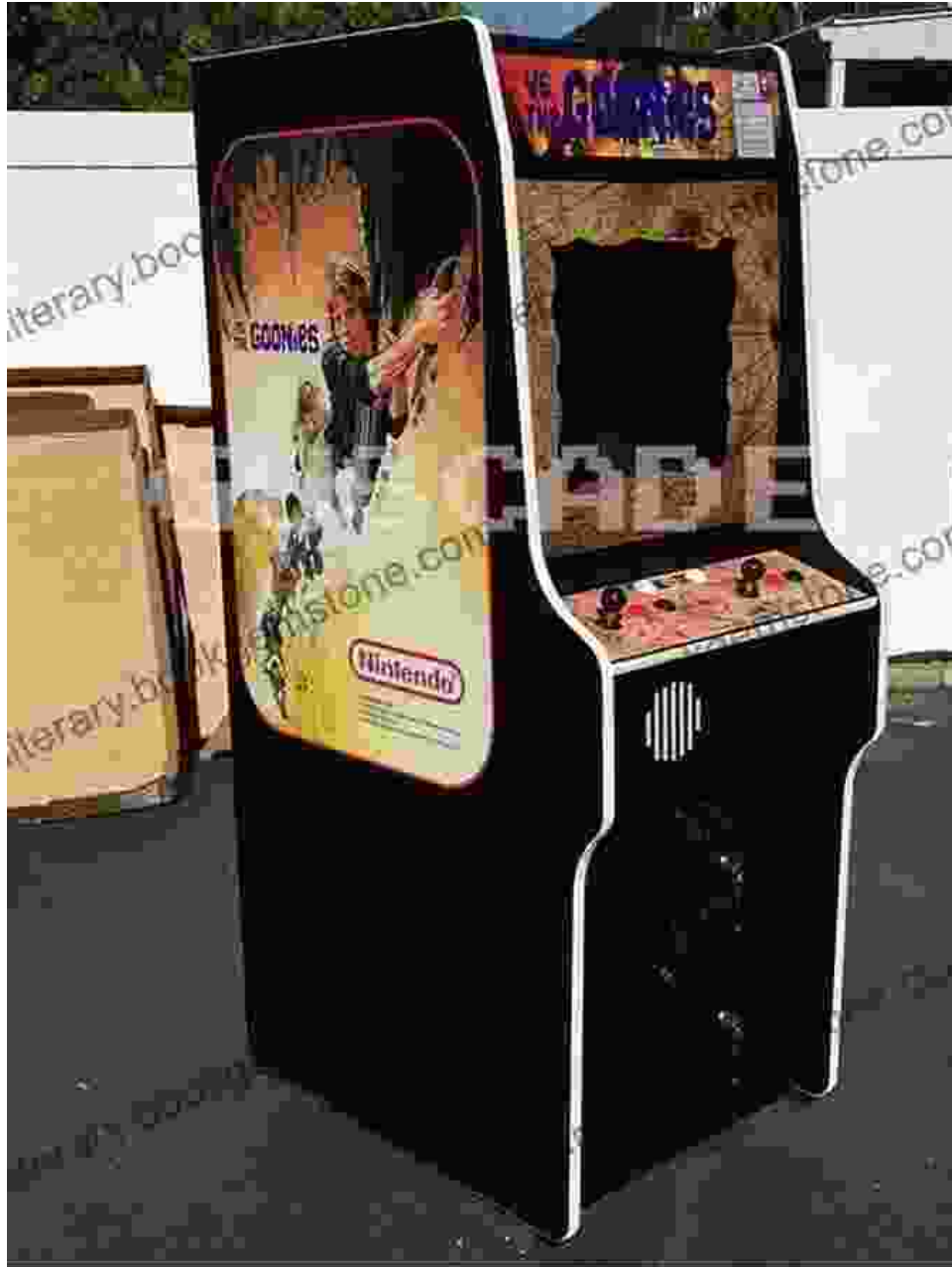
The Goonies Transport arcade cabinet, a retro gaming masterpiece.