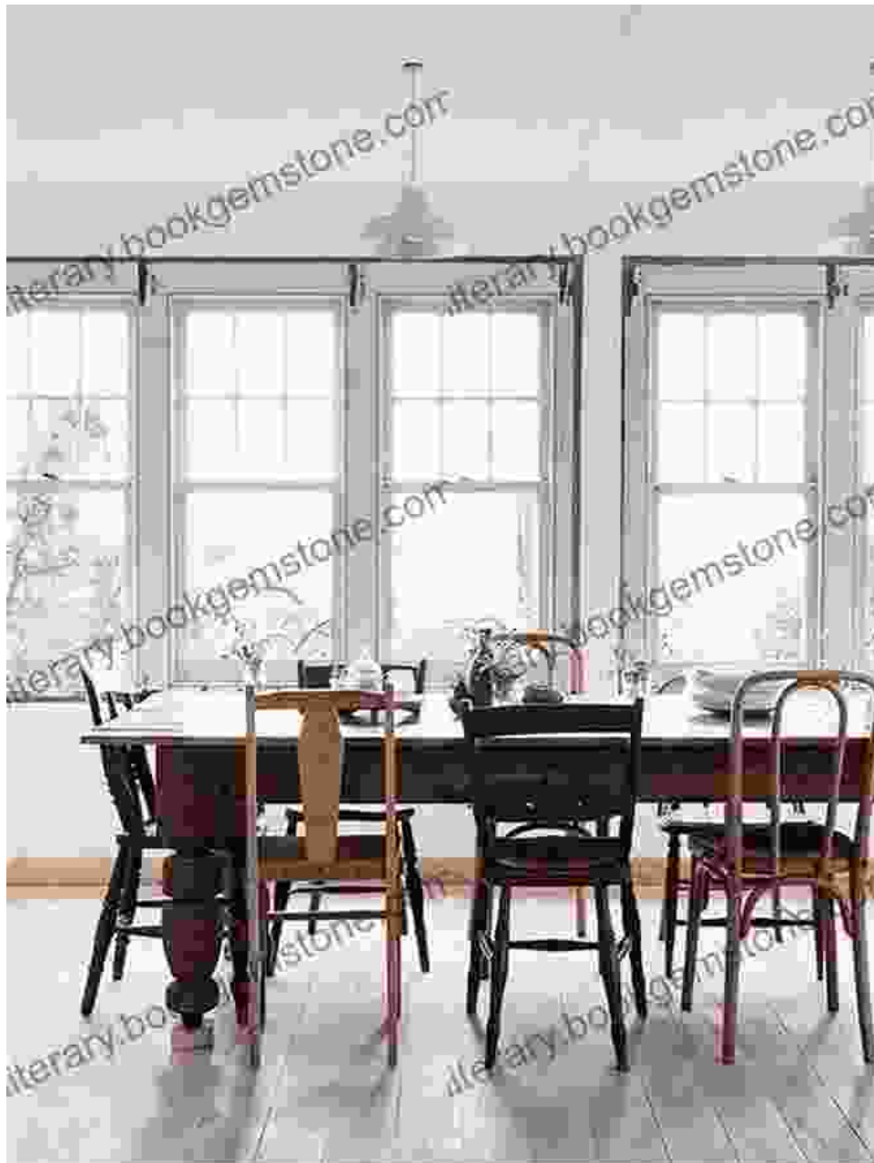
Creating a Down-to-Earth Living Space