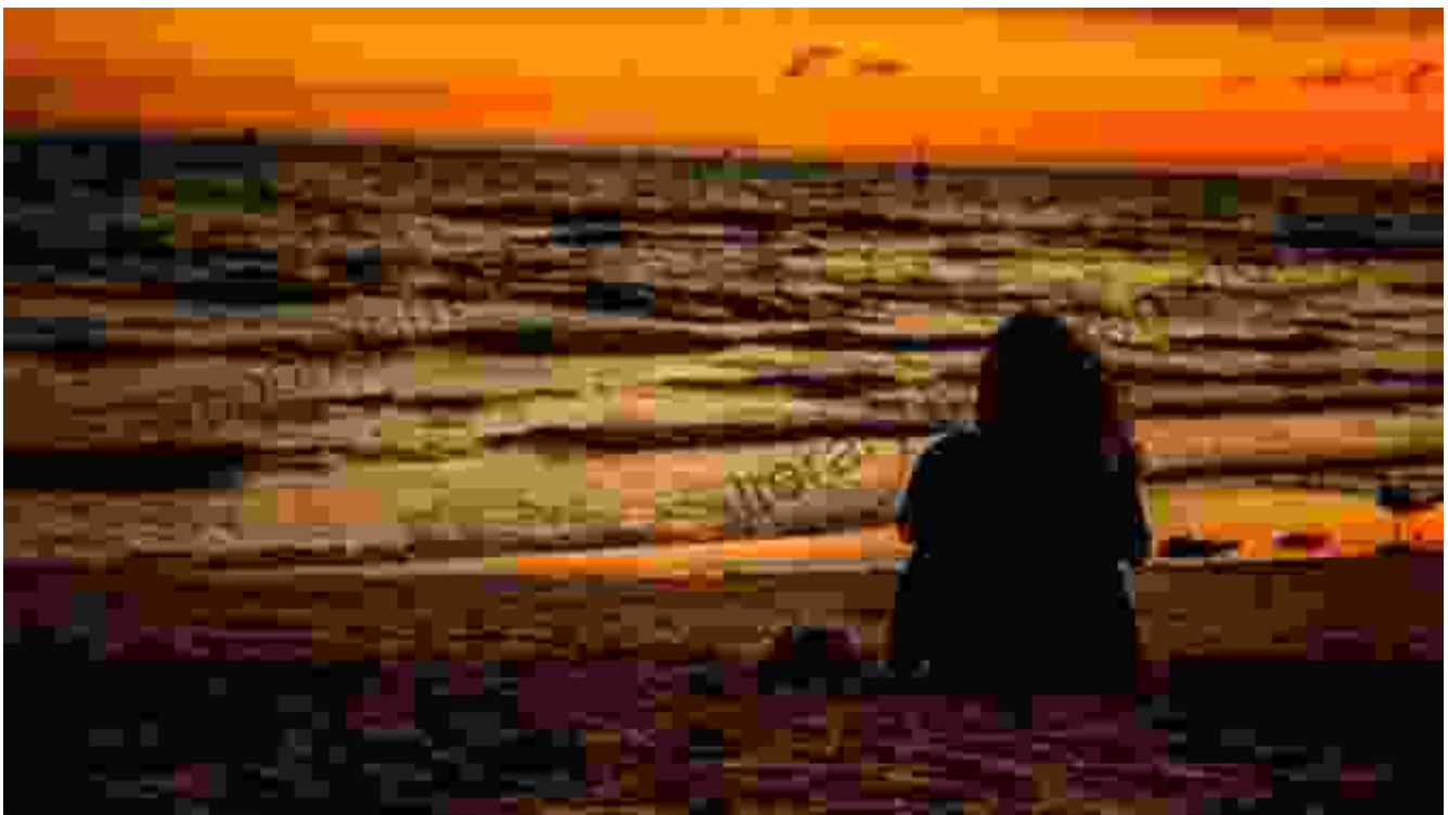
A traveler contemplating her journey

As my journey from Costa Rica to Cambodia drew to a close, I took some time to reflect on my experiences. I had witnessed the wonders of nature, explored ancient civilizations, and connected with people from all walks of life.